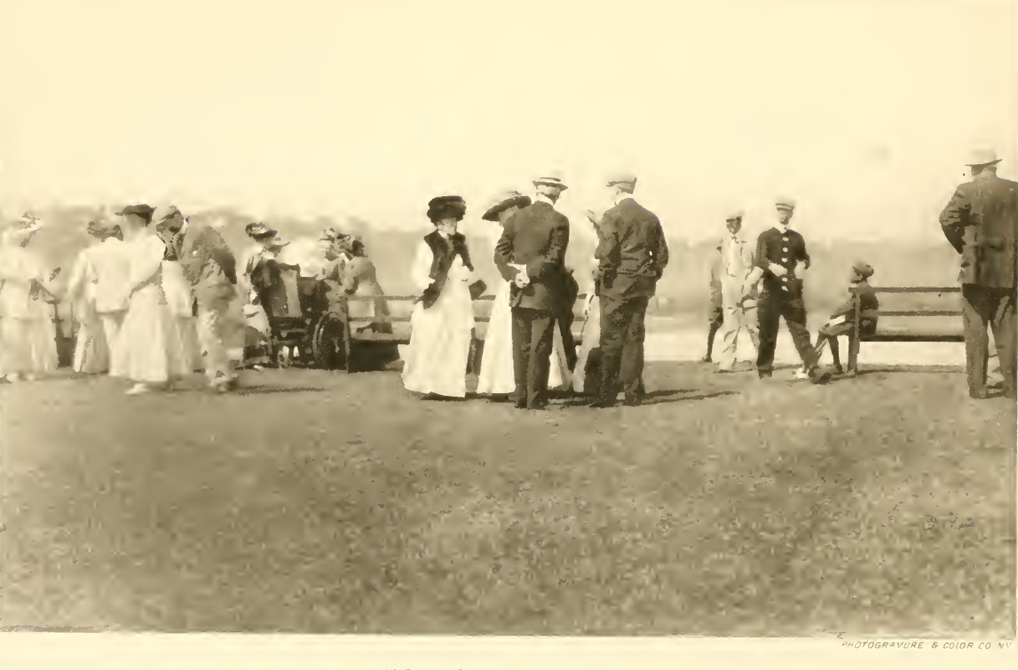
NEW GOLF COURSE