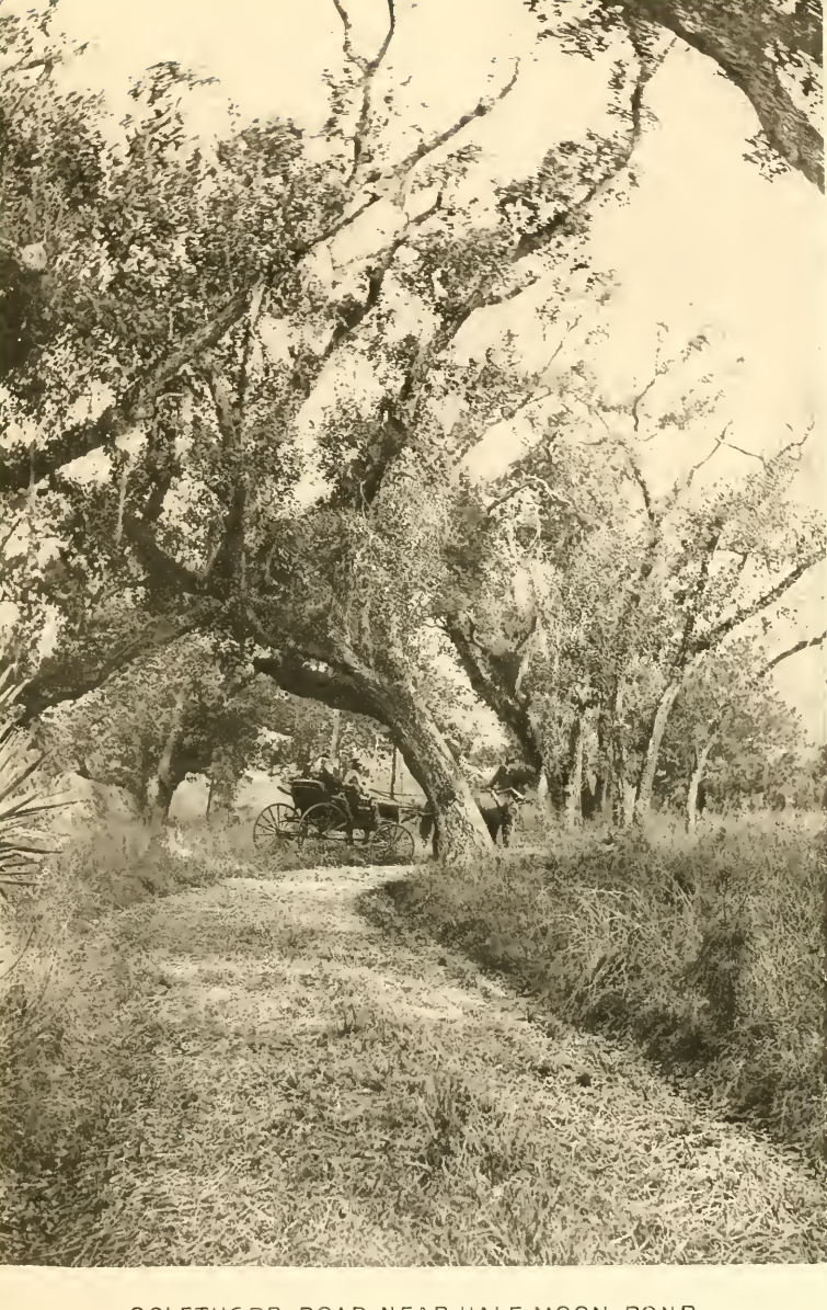
OGLETHORP ROAD NEAR HALF MOON POND