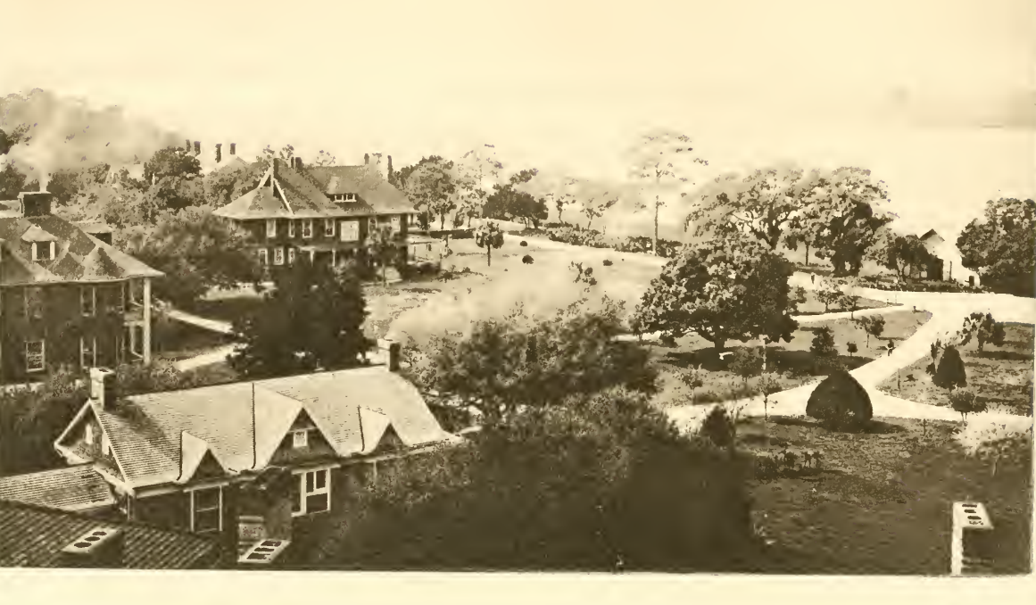
FROM CLUB HOUSE LOOKING SOUTH