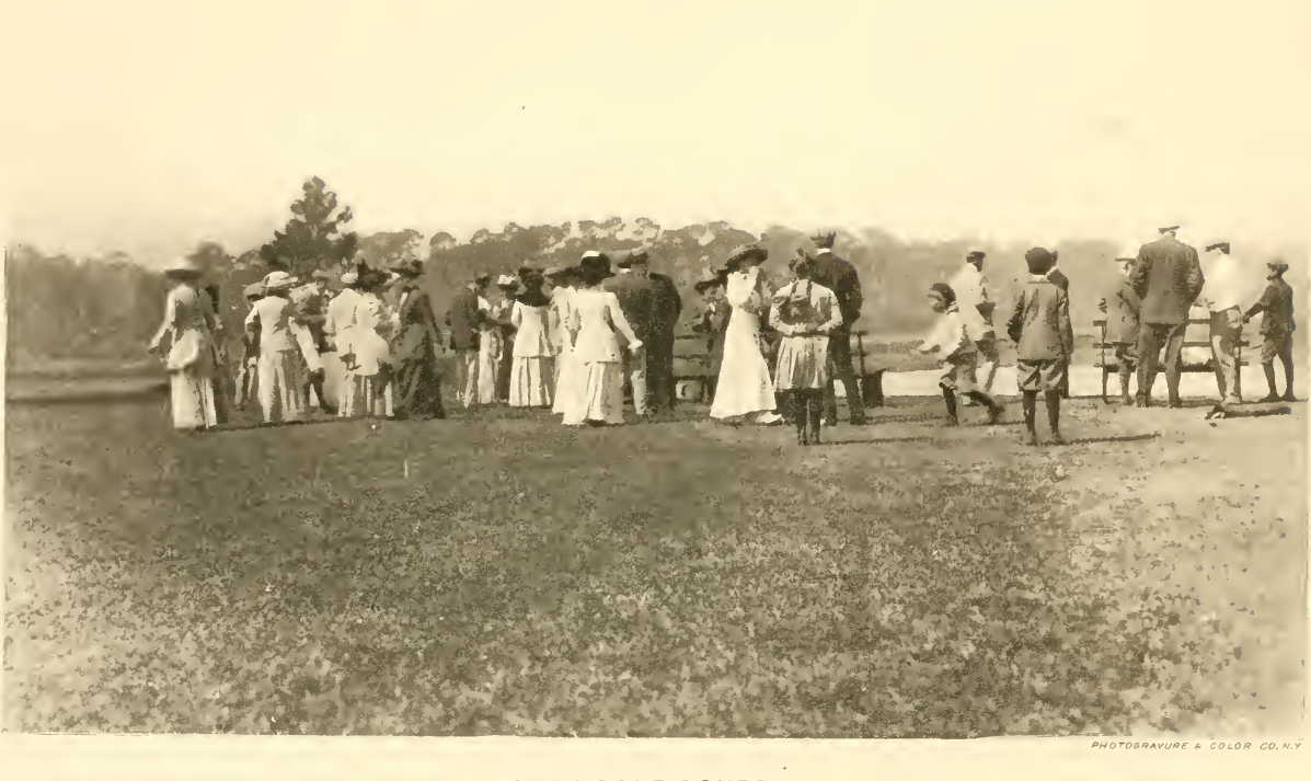
NEW GOLF COURSE