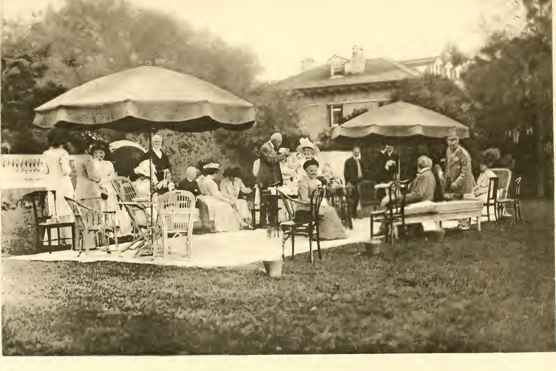
"LAWN PARTY" MISTLETOE COTTAGE