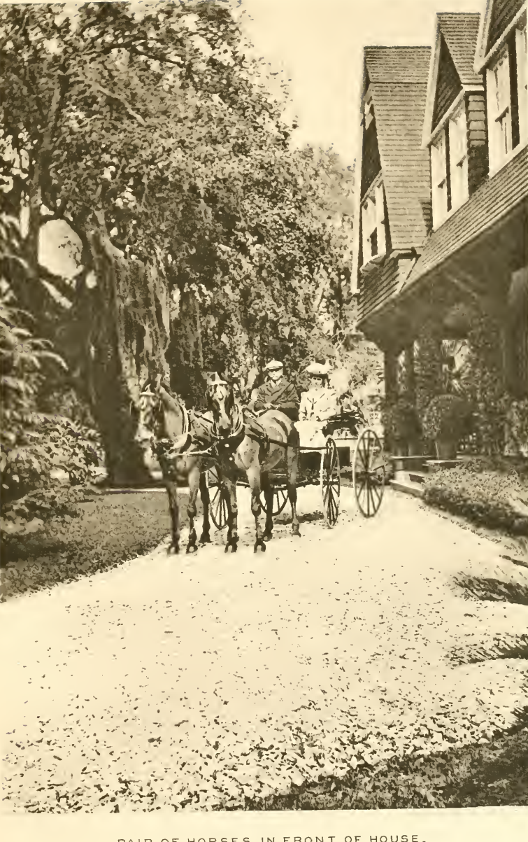
PAIR OF HORSES IN FRONT OF HOUSE.