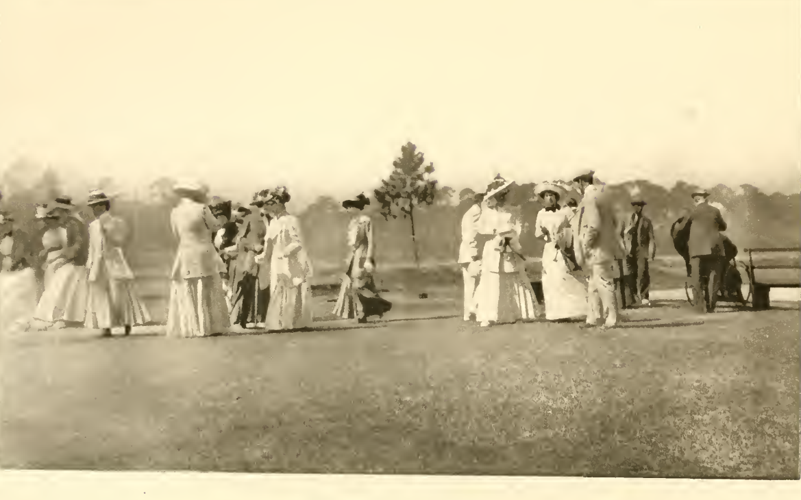
NEW GOLF COURSE