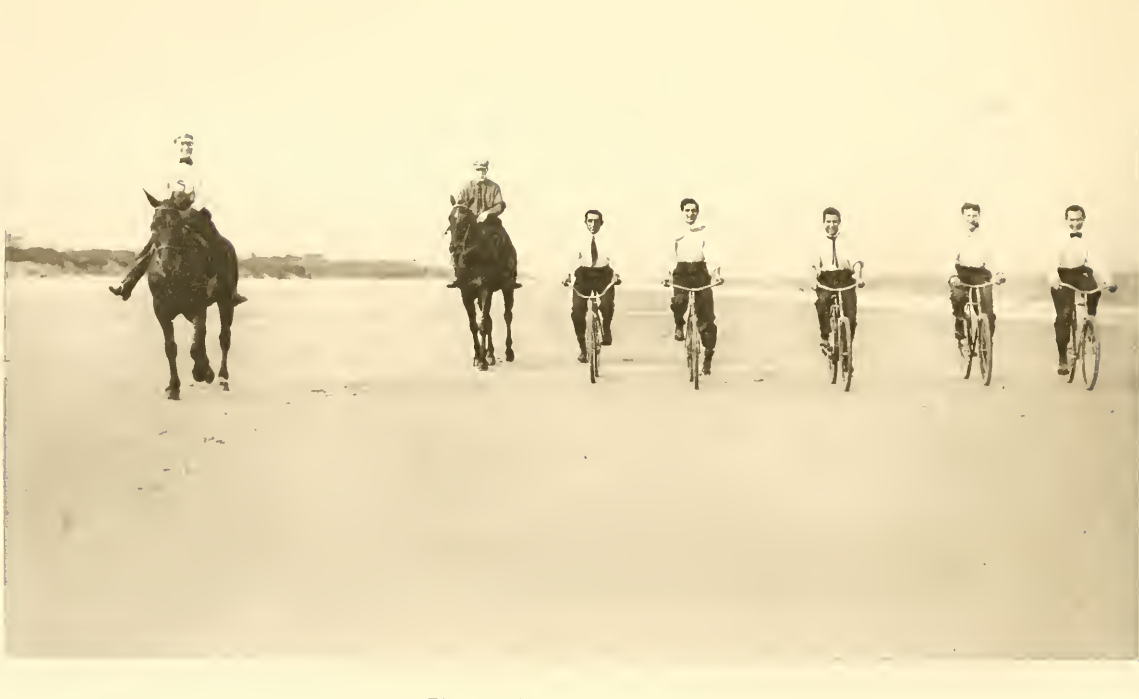
ATLANTIC OCEAN BEACH