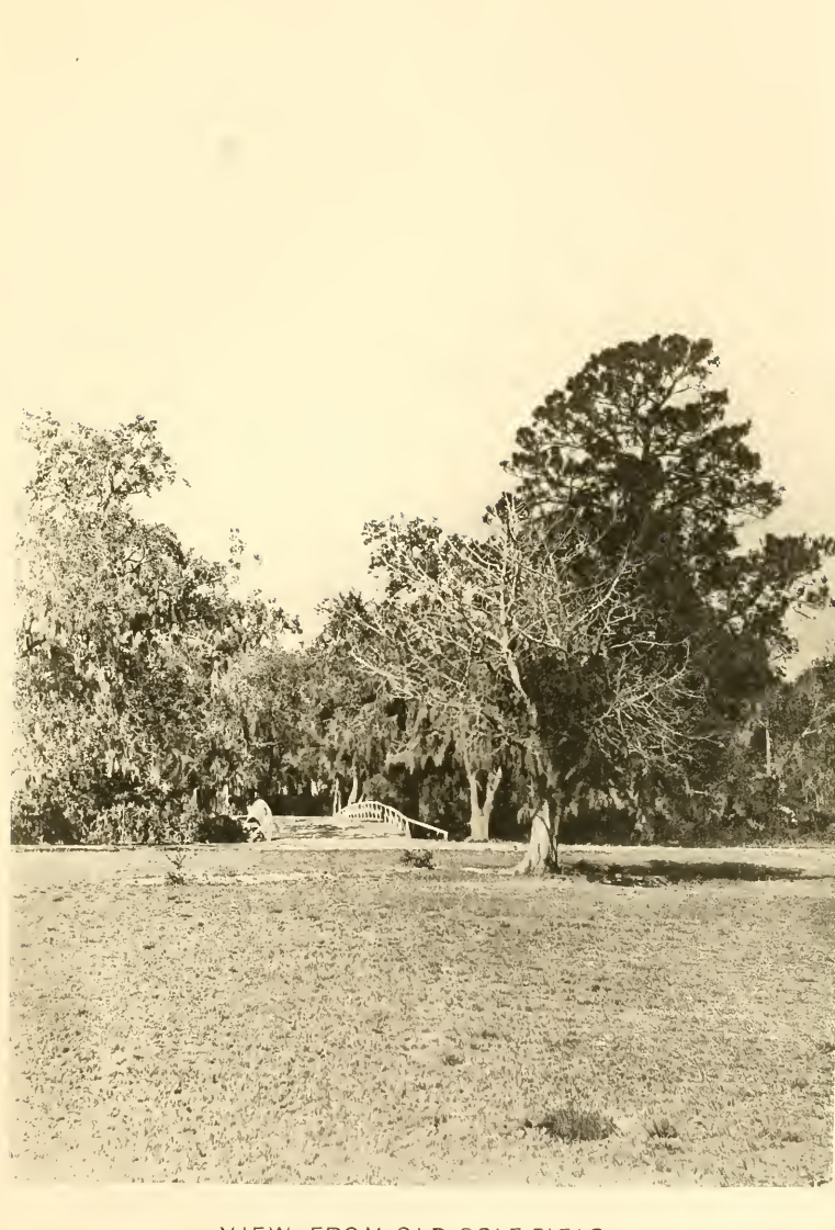
VIEW FROM OLD GOLF FIELD