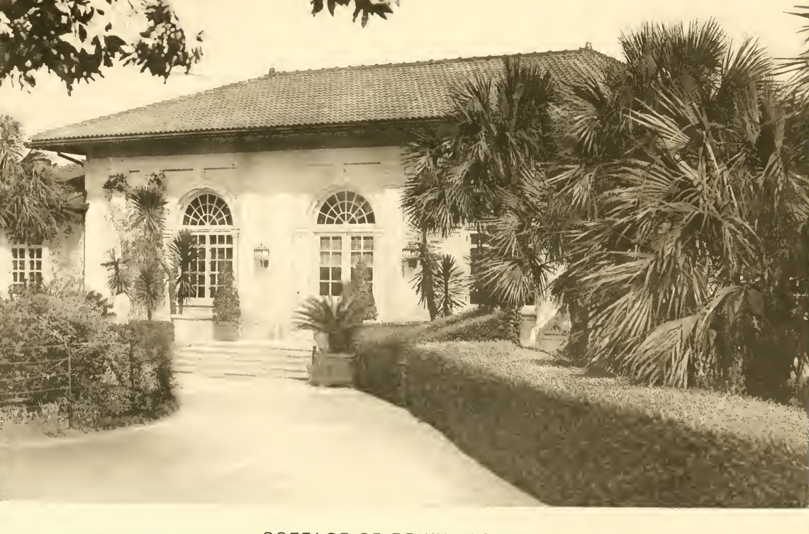
COTTAGE OF EDWIN GOULD