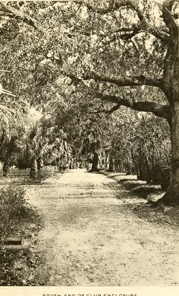
SOUTH END OF CLUB ENCLOSURE