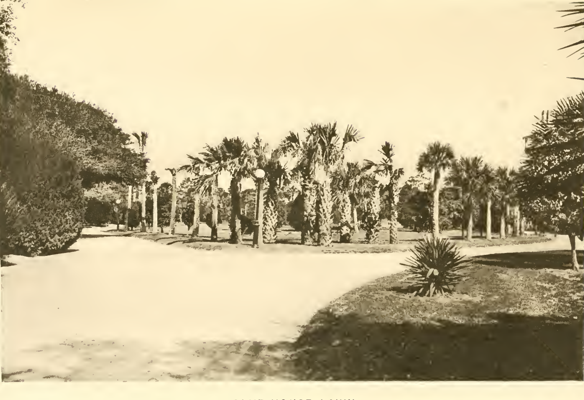
CLUB HOUSE LAWN