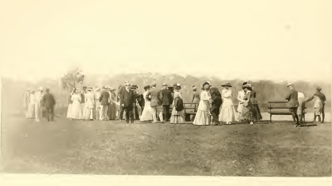
NEW GOLF COURSE