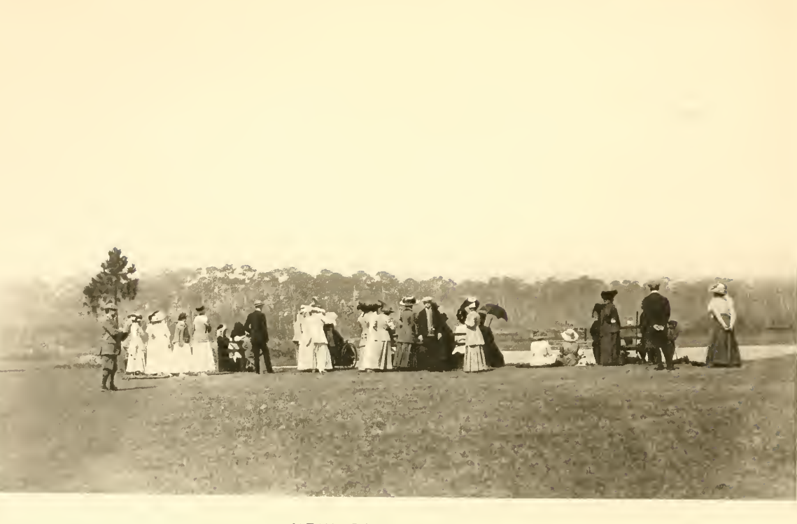
NEW GOLF COURSE