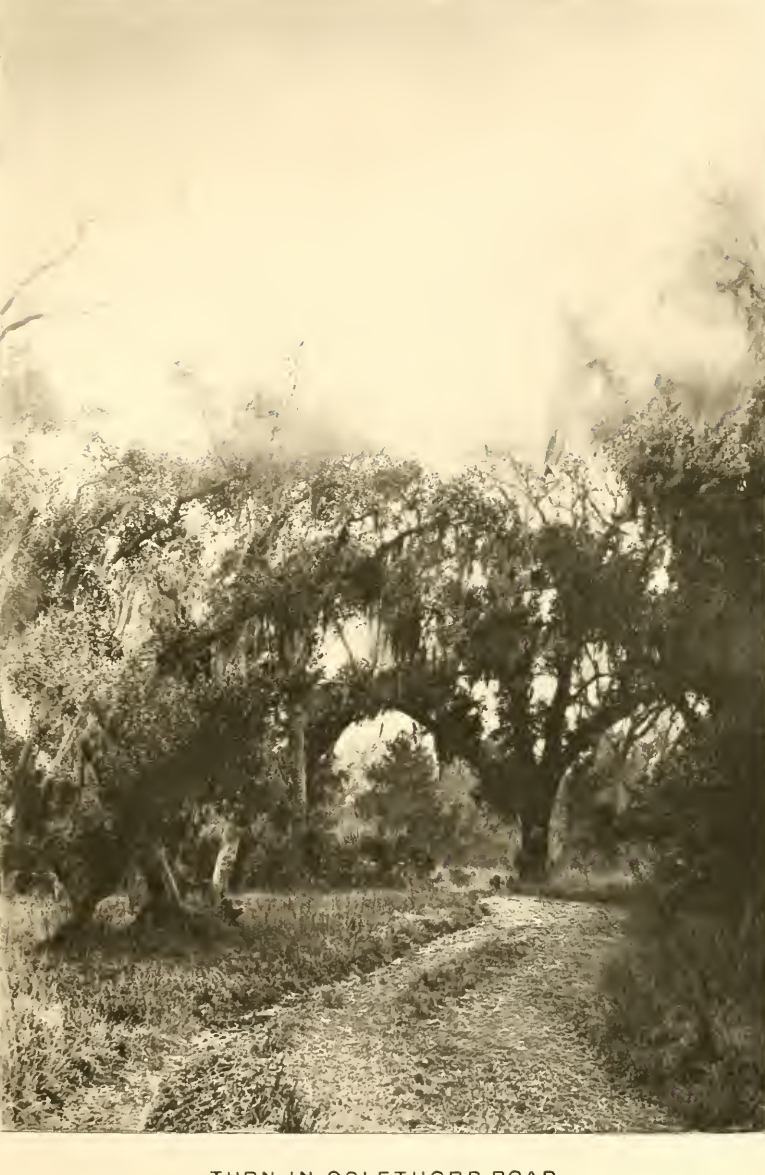
TURN IN OGLETHORP ROAD