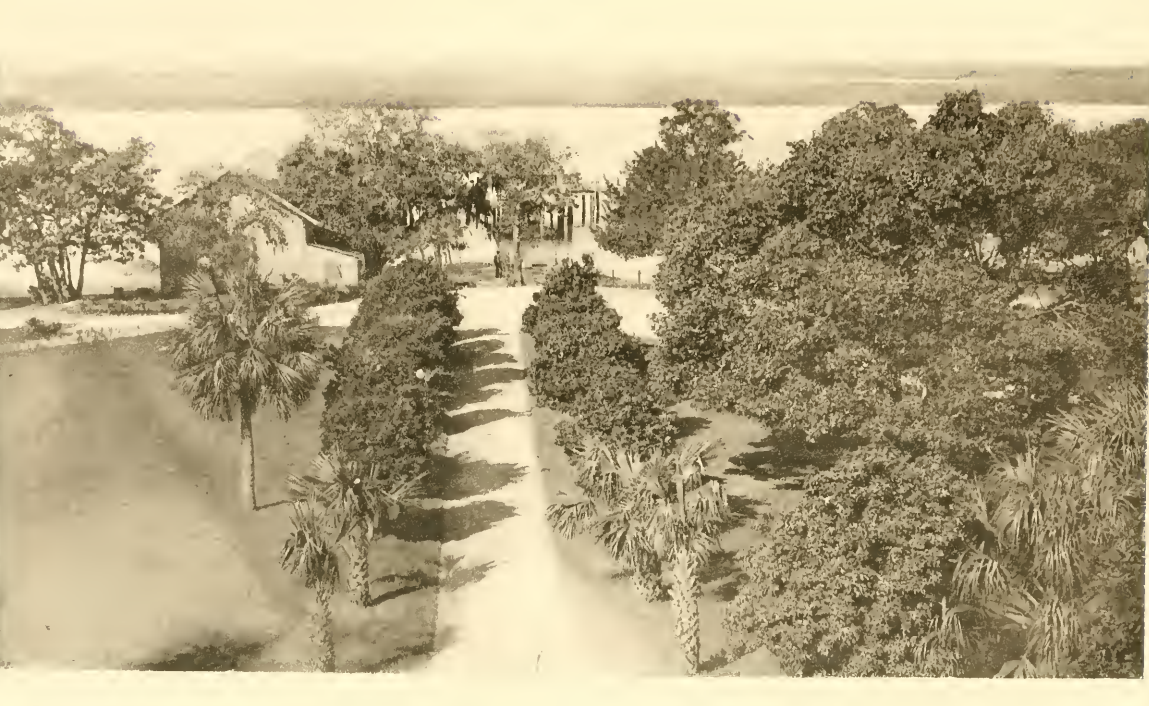
ROAD TO BOAT LANDING