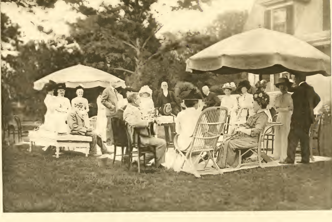
"LAWN PARTY" MISTLETOE COTTAGE