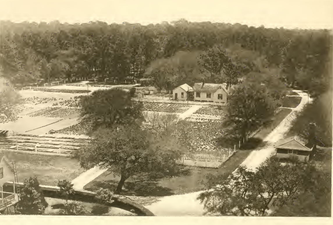
BIRDS EYE VIEW OF VEGETABLE GARDEN