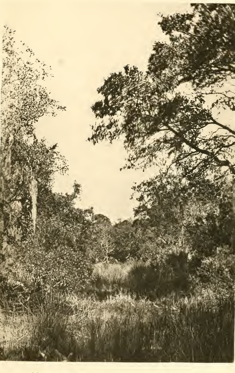
LOCKING EAST FROM FIRST BRIDGE JESSAMINE ROAD.