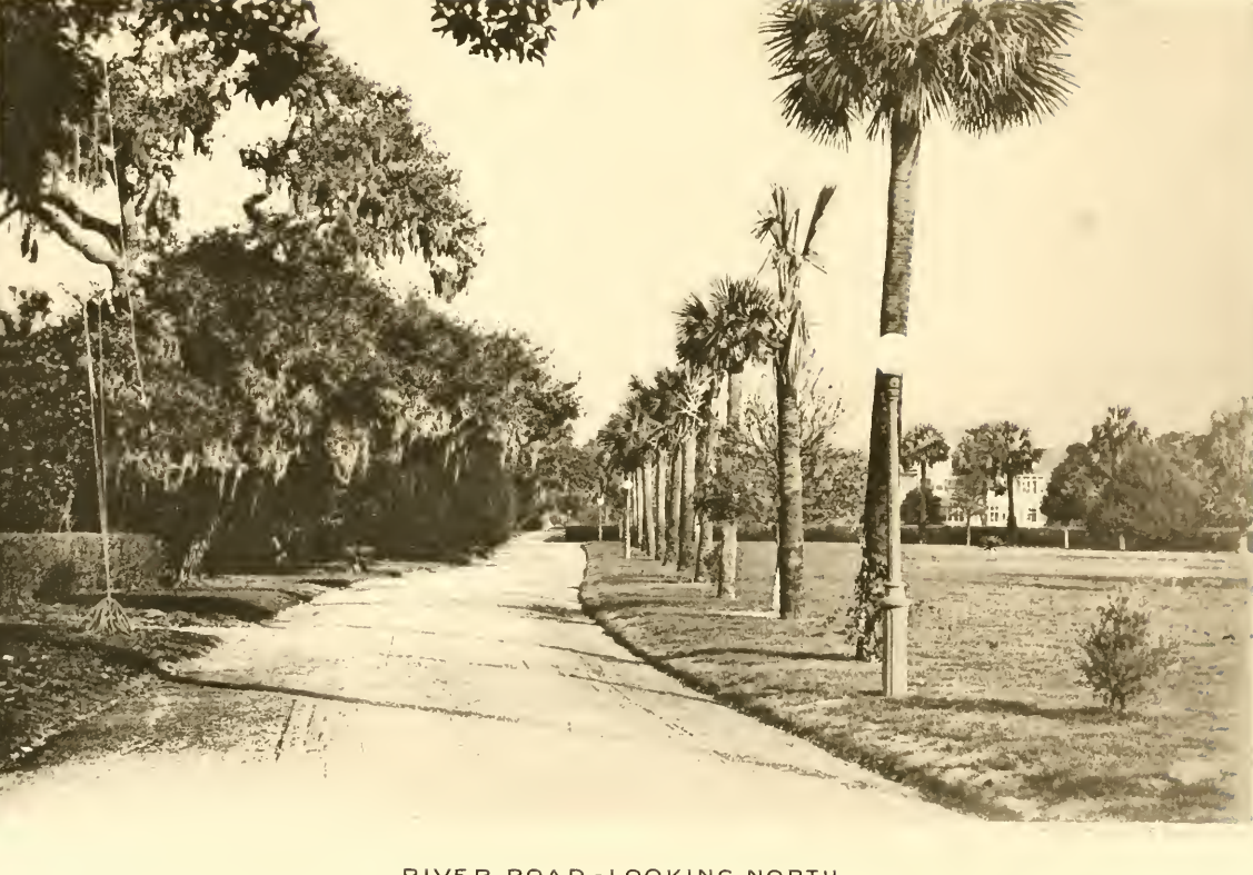
RIVER ROAD - LOOKING NORTH