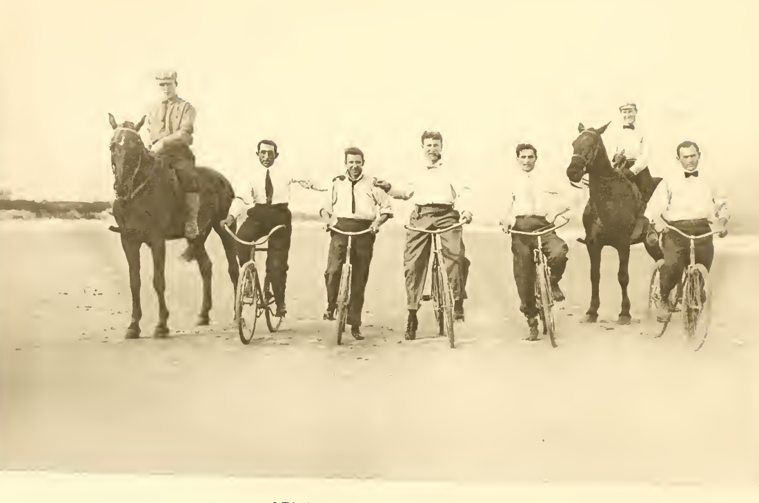
ATLANTIC OCEAN BEACH