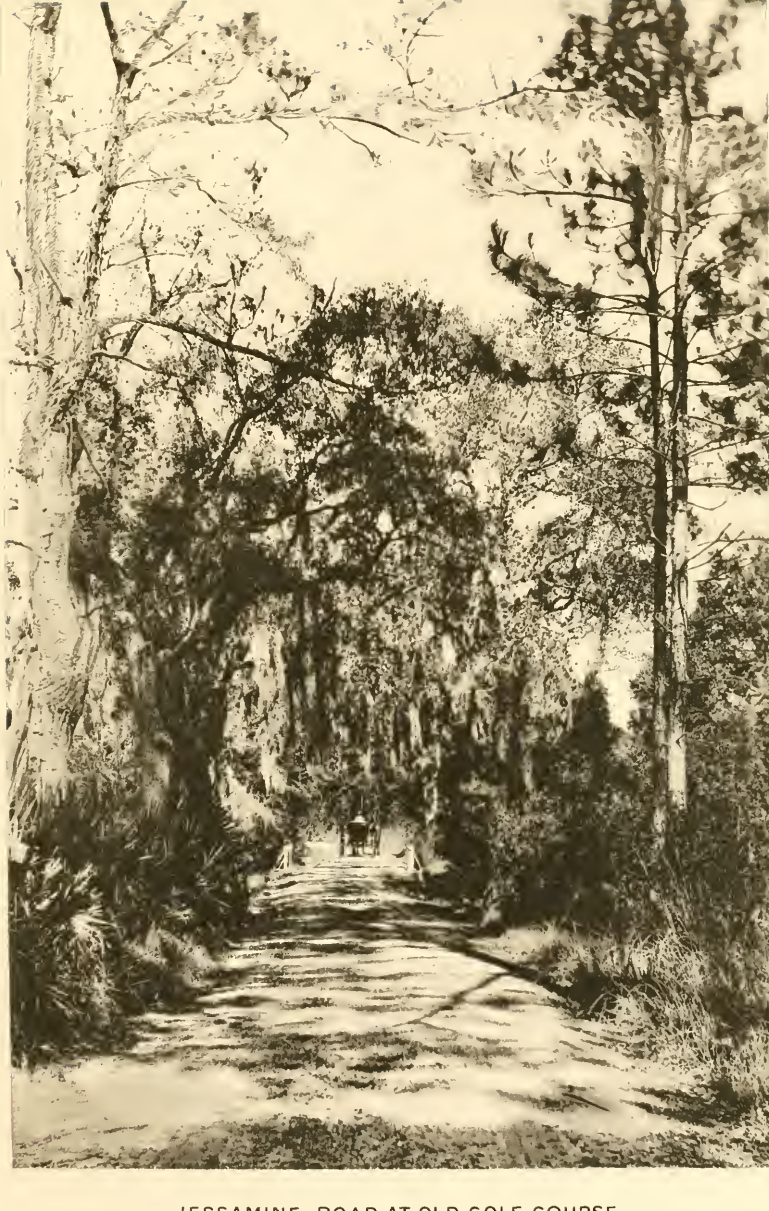
JESSAMINE ROAD AT OLD GOLF COURSE