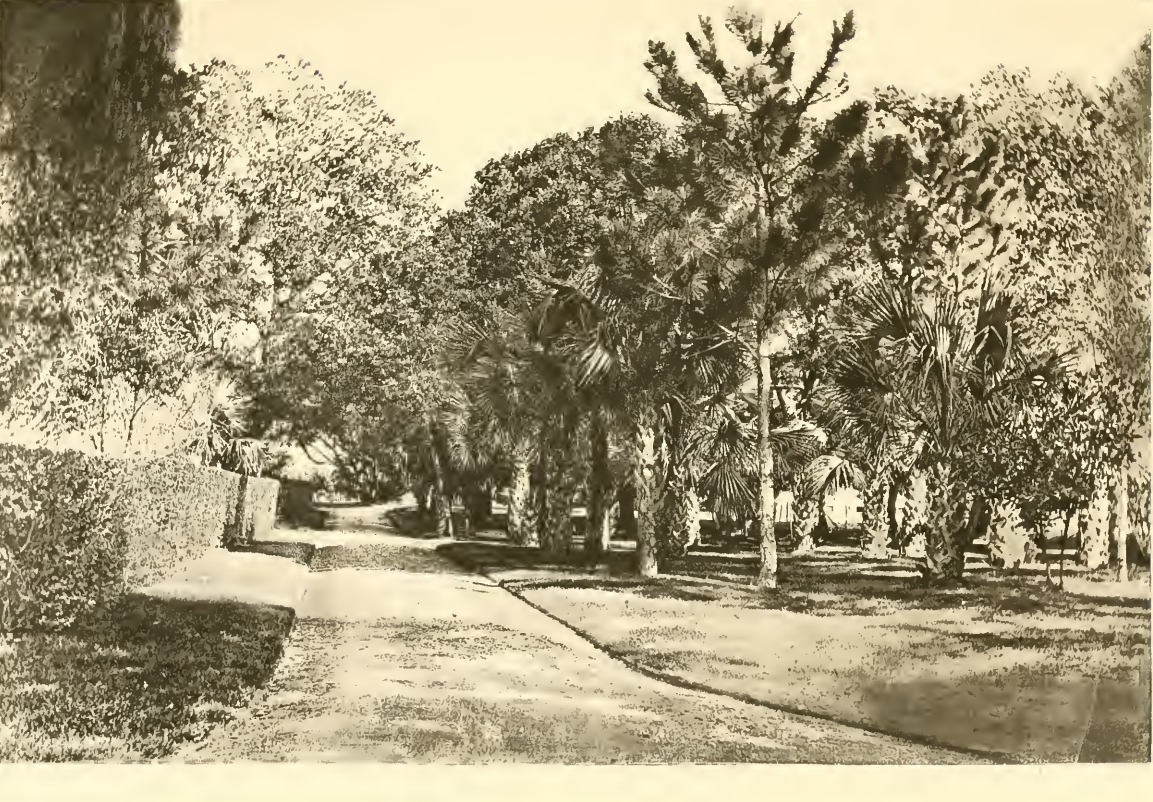
PALMETTOS - OAKS AND PINES