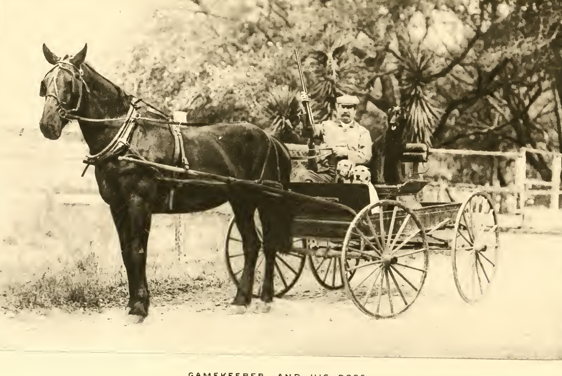
GAMEKEEPER AND HIS DOGS