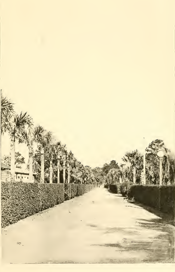
OLD PLANTATION ROAD