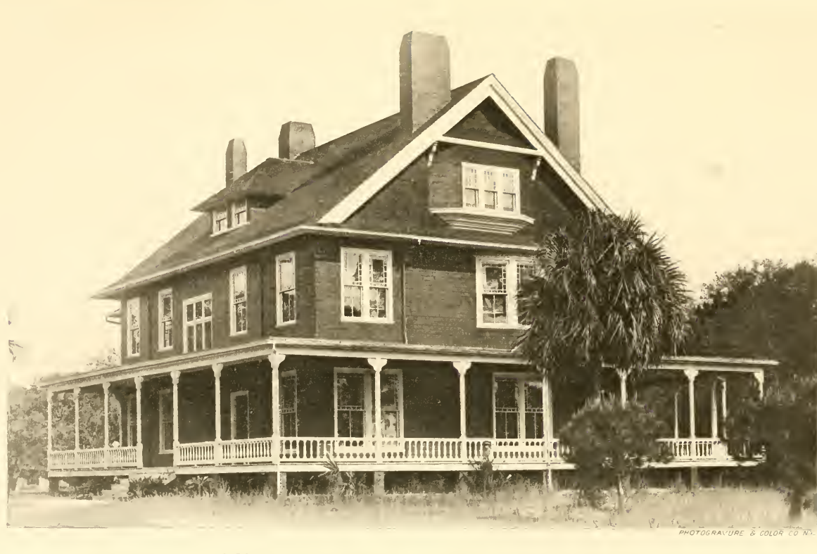
COTTAGE OF WILLIAM ROCKEFELLER