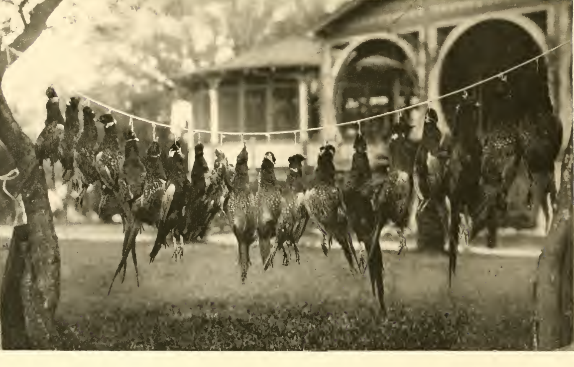
"PHEASANTS" KILLED ON JEKYL