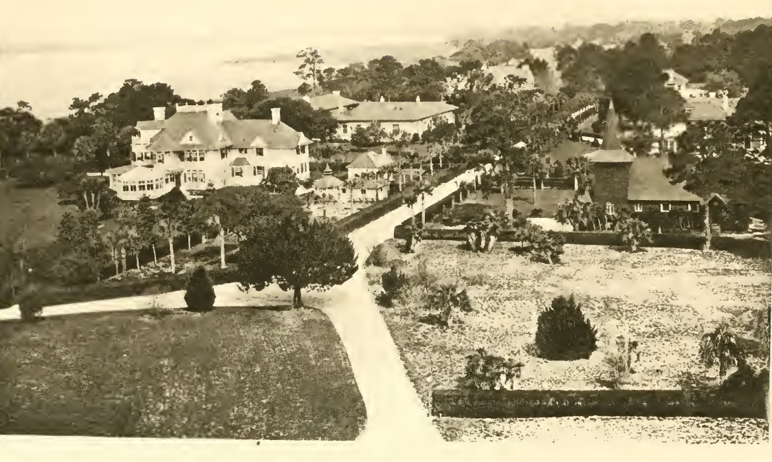
FROM CLUB HOUSE LOOKING NORTH