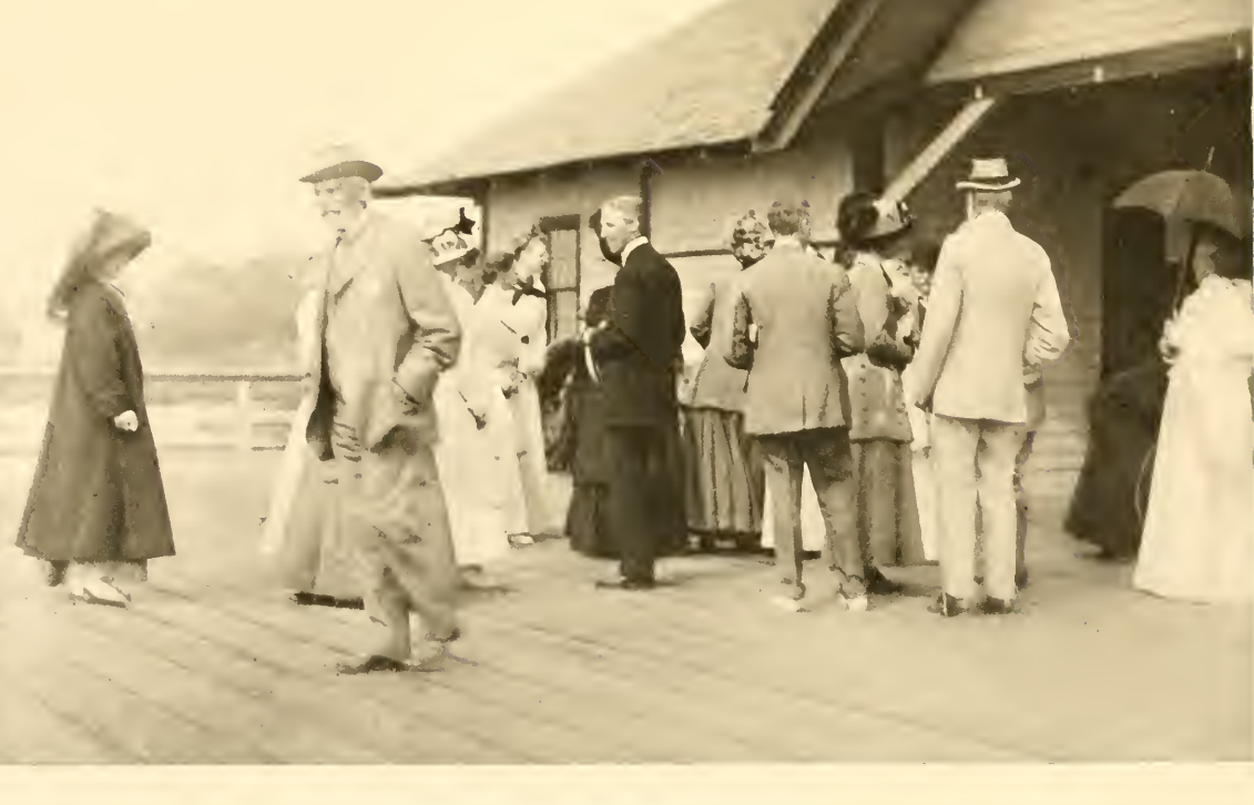
"GOOD BYE" ON JEKYL WHARF